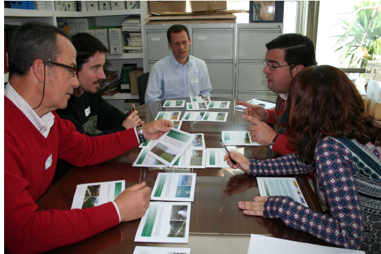
Figure 3: land use classification exercise

Following the categorization exercise, participants returned to their groups to discuss the motivating factors, or drivers of land use change . The exercise involved evaluating a series of maps in which major land use change tendencies had been plotted, and giving answers to a series of open questions such as "what are the causes of this change dynamic", "which land uses are losing as a result, and which are gaining" and finally "what degree of reliability do you consider this map to have?" The process of group discussion that this generated was extremely fruitful and revealing. Interestingly, no tension was noticeable between representatives of different interest groups (conservation managers, farmers representatives).